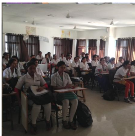
Participants in seminar on “Scope after BPT”