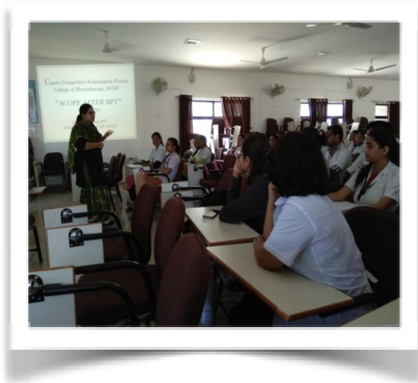
CCEF coordinator, COP taking seminar on “Scope after BPT”