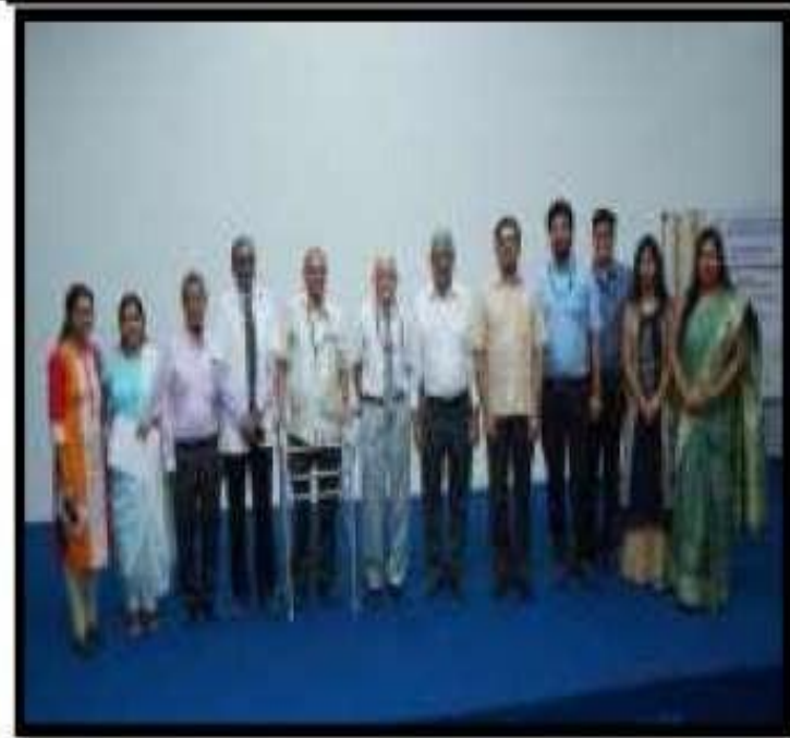
Group photo of guest speaker and organizing committee, SBKSMIRC.