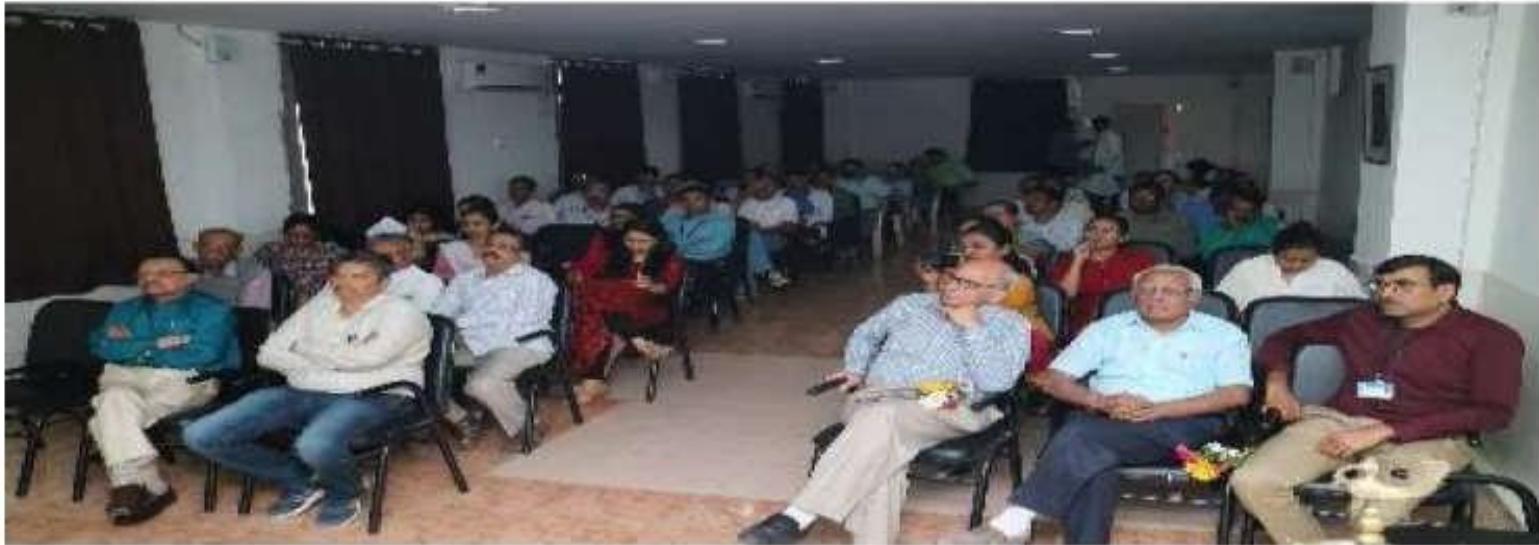
The audience keenly listening to the session about pap smear- a simple life saving screening procedure