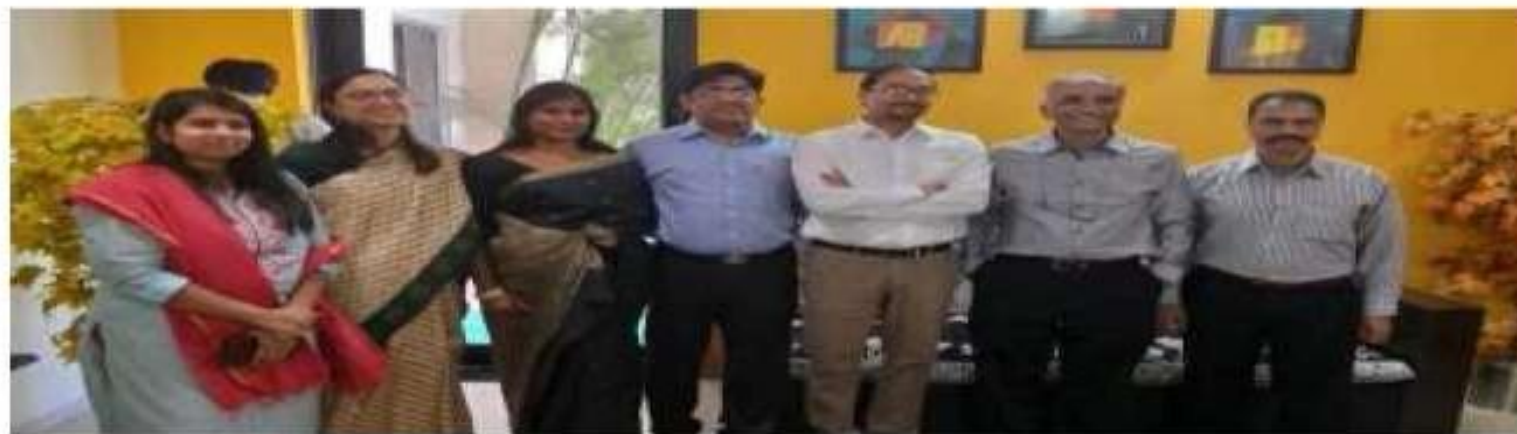
All faculties gathered for a lunch after the CME.