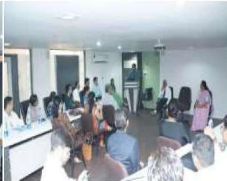
Participants attending the ice breaking and system approach