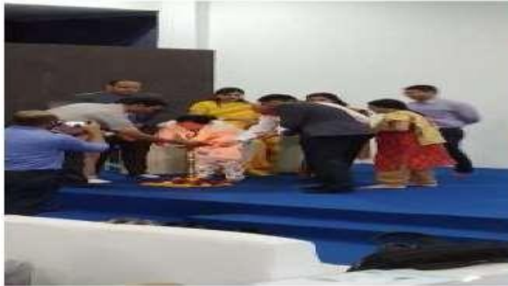
LAMP LIGHTING CEREMONY BY DIGNITARIES