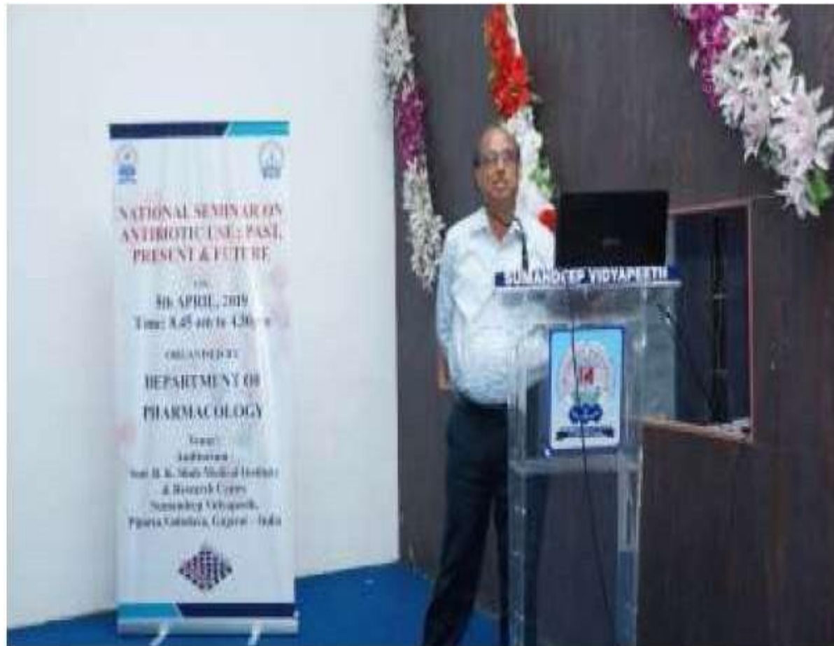
Lecture 2 Principles To Guide Antibiotic Therapy