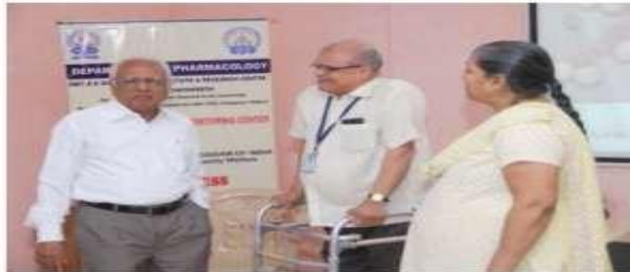
Welcome Note By Dean Sir