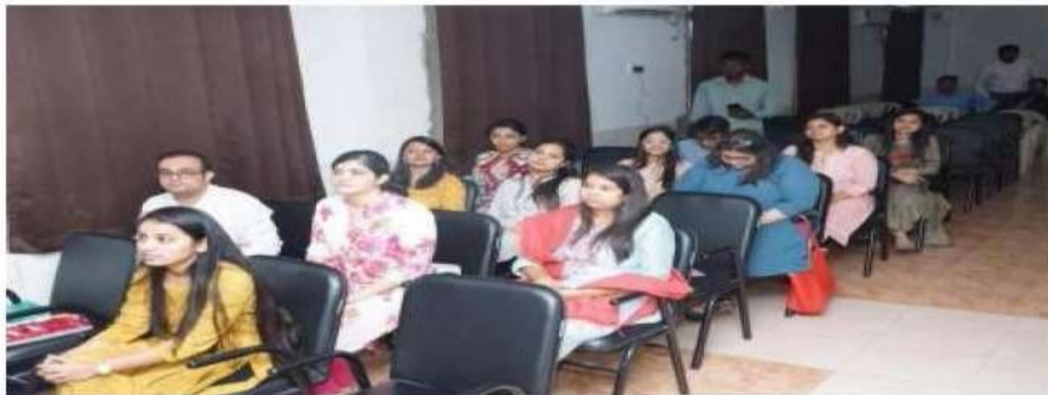
Delegates attending the talk