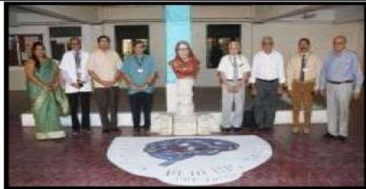
Group photo at entrance