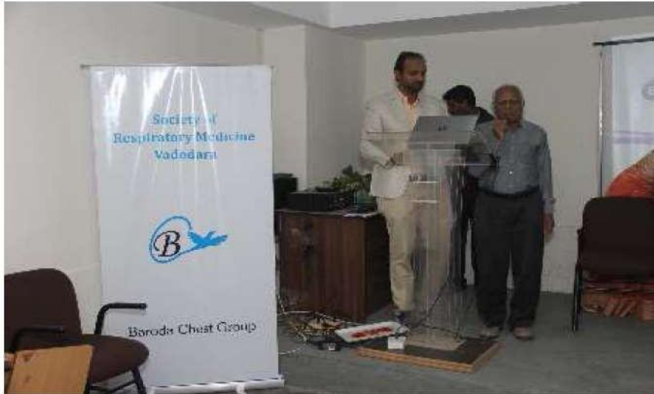
Dean sir addressing the audience