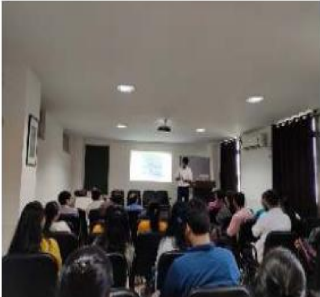
Speaker discussing about electronic data keeping