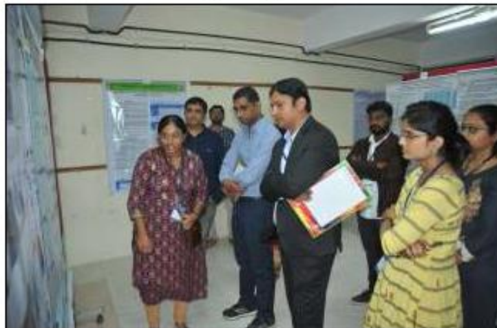
Poster presentation by participants