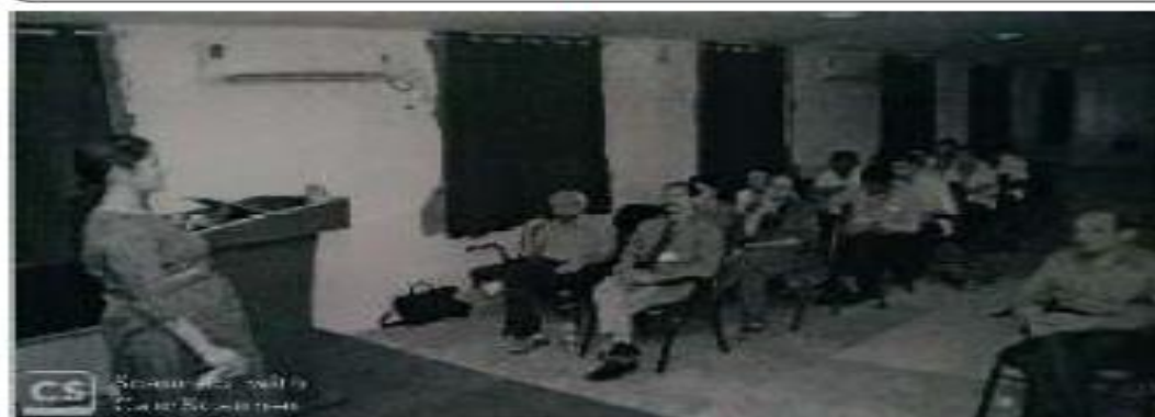
Lecture 2 - Speaker