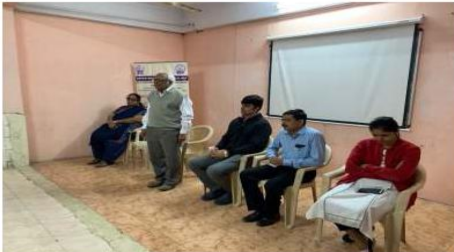
Welcome Note By Dean Sir