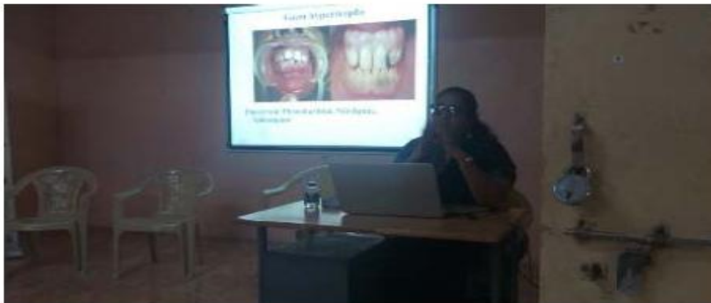
Lecture 1: Pharmacovigilance: Overview