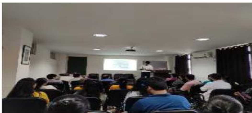
Speaker discussing about electronic data keeping