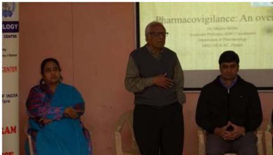
Welcome Note By Dean Sir