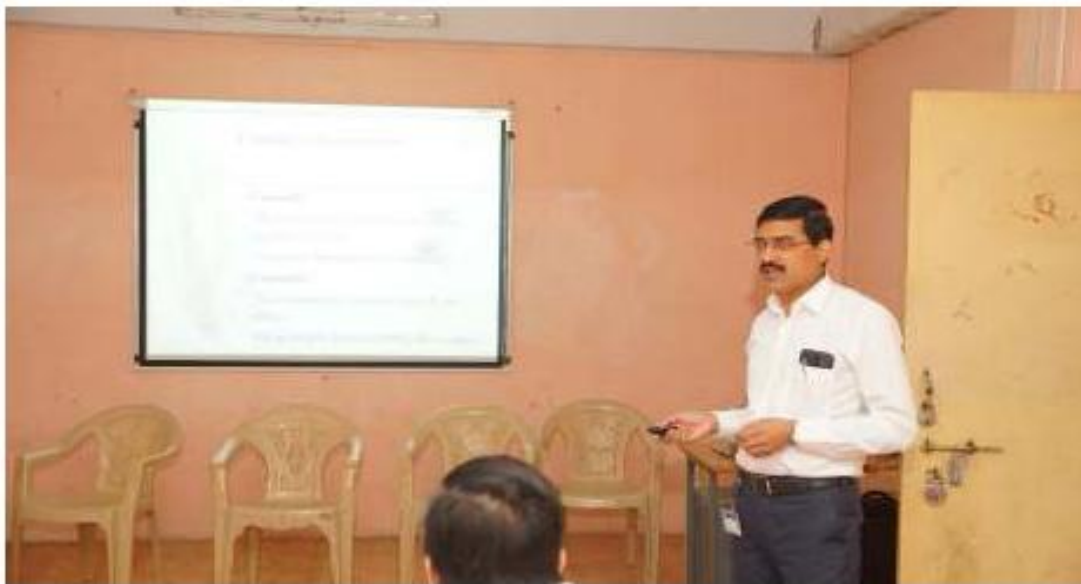
Lecture 2: Causality Assessment