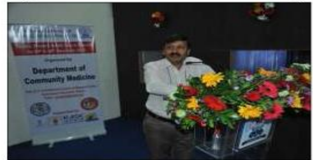
Conference address by Chief Guest