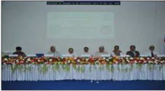
Chief Guest and other invitees on Stage

Photographs – Joint Annual Conference of IAPSM GC(XXVII) and IPHA GC(IX)