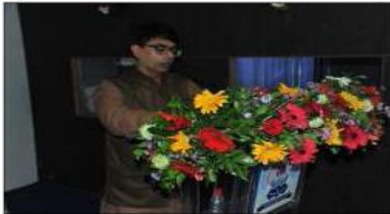
Welcome note by Organizing Chairperson