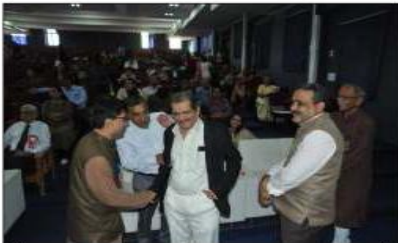
Participants and organizing Team