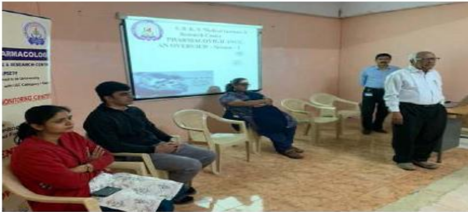
Welcome Note By Dean Sir

Pharmacovigilance Workshop Conducted On 09-01-2020