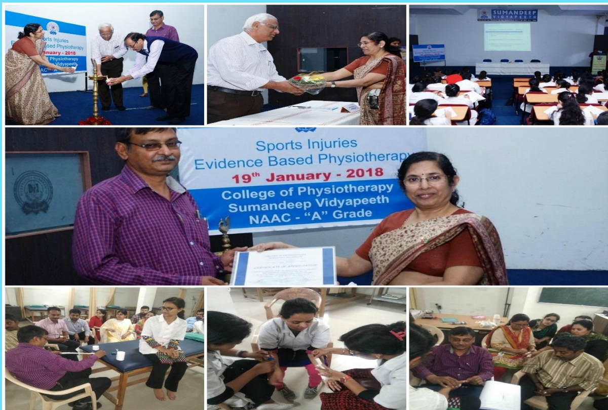
Photo gallery of CME and Workshop

Following Lunch, hands on workshop on Taping Techniques – Hands on Training was arranged for faculties & PGs of college of physiotherapy at electrotherapy department of college of physiotherapy. Total 25 participants took advantage of this workshop.